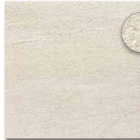
DAR66735 PEI 5 ○ 890 | m 2 matt beige | beige