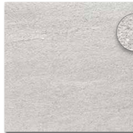
DAR66737 PEI 5 ○ 890 | m 2 matt grau | grey