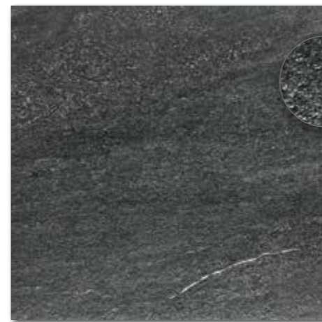
DAR66739 PEI 4 ○ 890 | m 2 matt schwarz | black