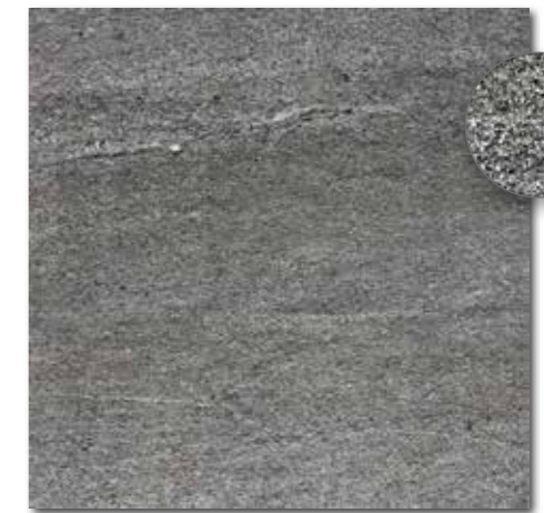
DAR66738 PEI 4 ○ 890 | m 2 matt dunkelgrau | dark grey