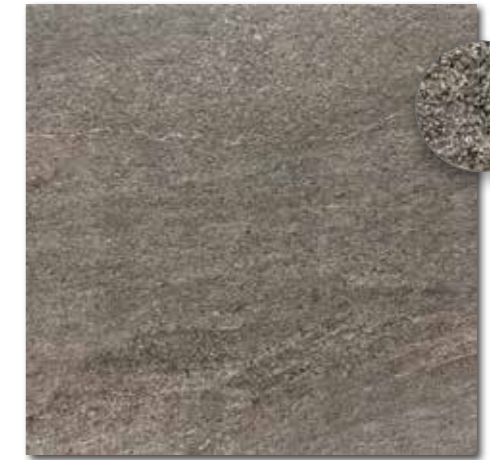
DAR66736 PEI 4 ○ 890 | m 2 matt braun | brown